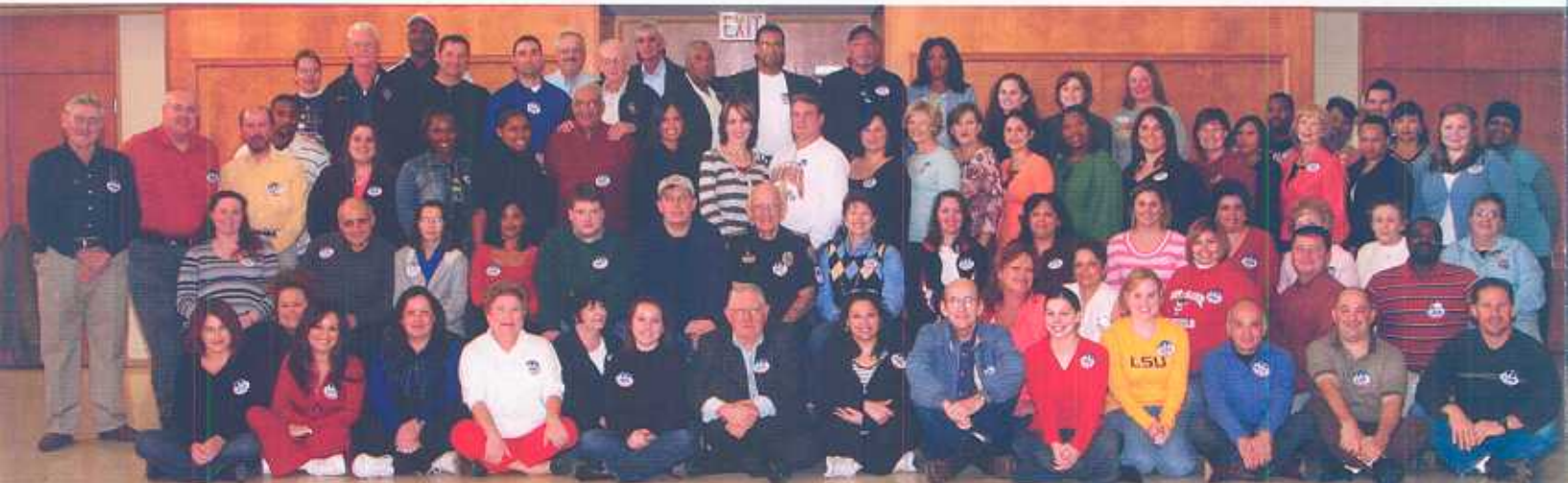
District Attorney's Staff